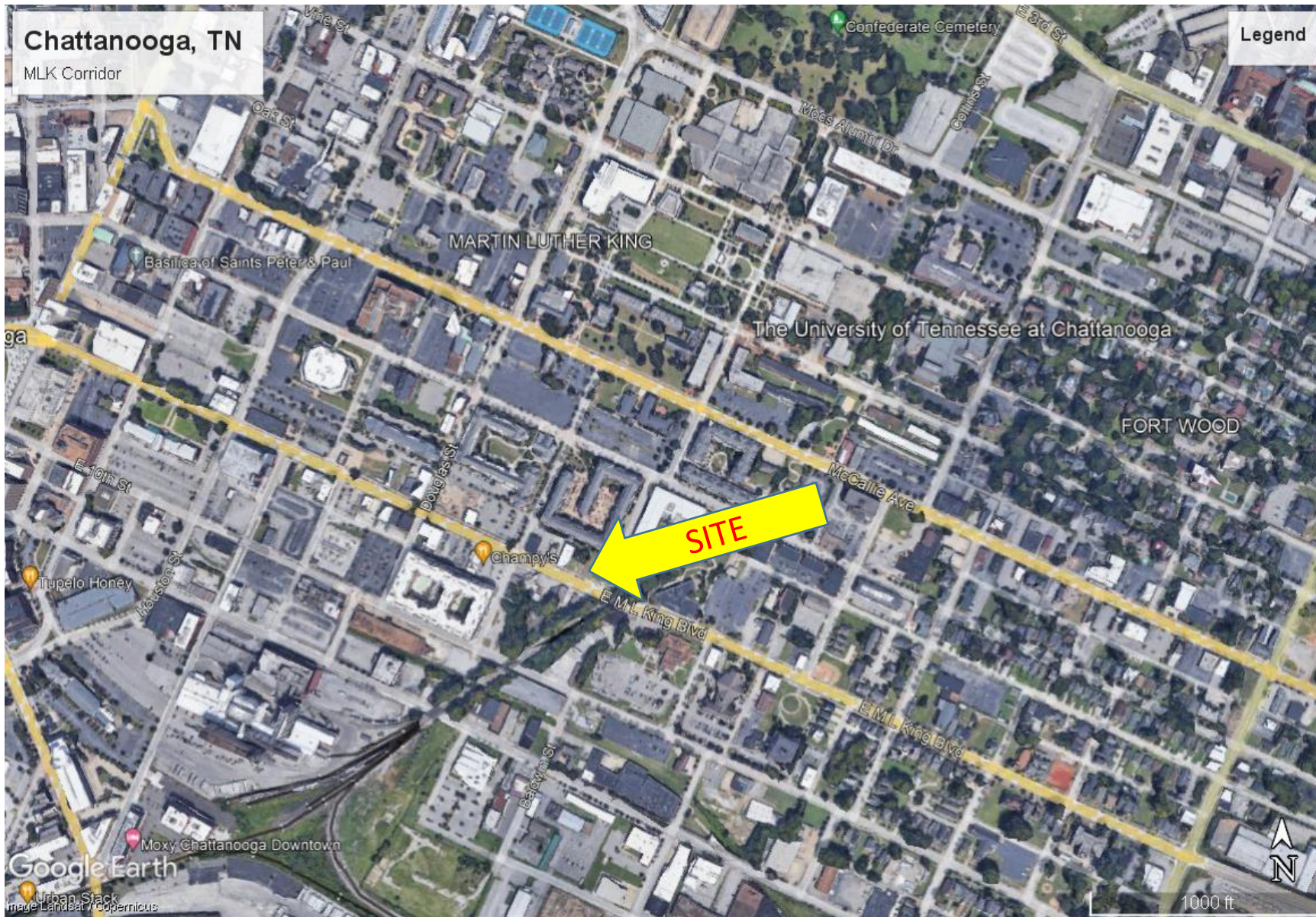
Chattanooga's MLK Corridor: Location of Site on MLK