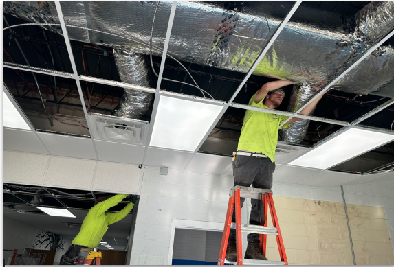
HVAC & Flooring Updates